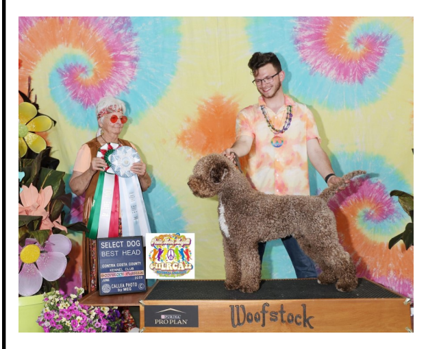
Boardwalk Here Comes the Sun Select Dog and Best Head on Saturday