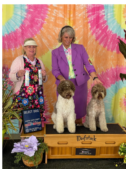
On Ice Select Bitch Saturday Left—Larcan's Meritage