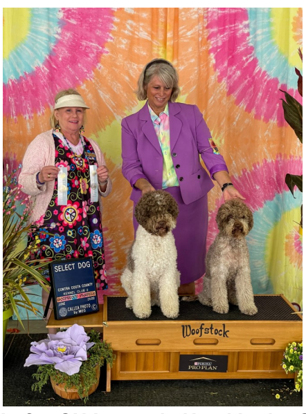
Left—CH Larcan's Head In the Clouds Sunday Select Dog

Right—GCH CH Larcan's I Love a Rainey Night Sunday Select Bitch