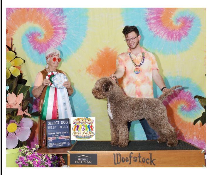
Boardwalk Here Comes the Sun Select Dog and Best Head on Saturday